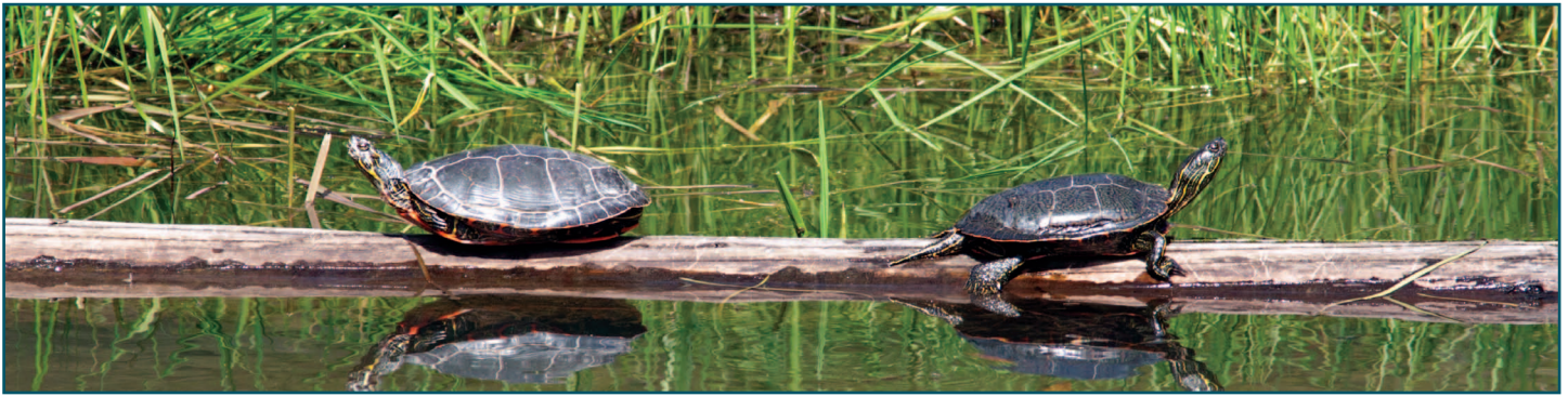
There is widespread wildlife and human exposure to several PFCs.